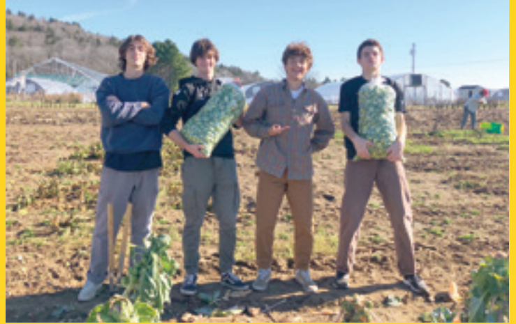
Peoples Academy students show off gleaned brussel sprouts after a day of gleaning with Salvation Farms at High Mowing Organic Seeds in Hyde Park, Vermont.

Our investment in trucks to expand our gleaning services in addition to a satellite office and pending walk-in cooler installation in northeast Vermont signal a strong trajectory of growth for Salvation Farms' Gleaning, its impact and partnerships. One of our new partners, the St. Johnsbury Academy, offered students the opportunity to process and freeze gleaned produce for distribution to charitable food sites in their community. Experiences like this and those of many volunteer gleaners provide individuals with a deeper understanding of the needs within their community and the impacts of localized agriculture.