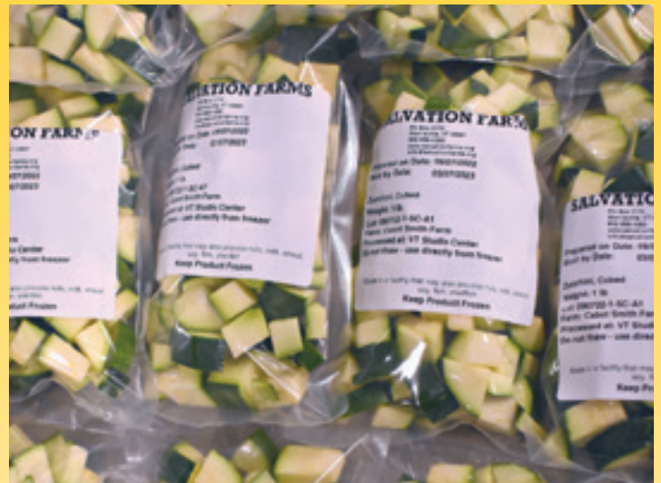
Preserving the harvest - fresh picked zucchini, diced, frozen, and package for use out of season.

Salvation Farms' frozen food was distributed to community food shelves and senior meal programs, increasing what it means for community members to access locally-grown food.