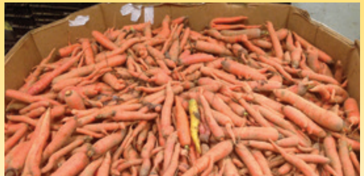
Large volumes of crops that farmers don’t have primary markets for make great candidates for brokering to Vermont’s prison meal programs.

As the end of 2022 approached and after a year hiatus from brokering, we began in earnest to reinvigorate our surplus produce brokering efforts in Vermont. Our Vermont Commodity Program staff reconnected with the Vermont Department of Corrections’ kitchen officers to learn more about the produce needs of our state’s correctional facilities. Outreach to farms and transportation partners was also reinitiated. These conversations help us better understand current supply chain dynamics, as much has changed in recent years. Salvation Farms remains committed to helping Vermont farms find viable markets for their surplus produce and is excited by the potential impact of growing this effort in 2023.