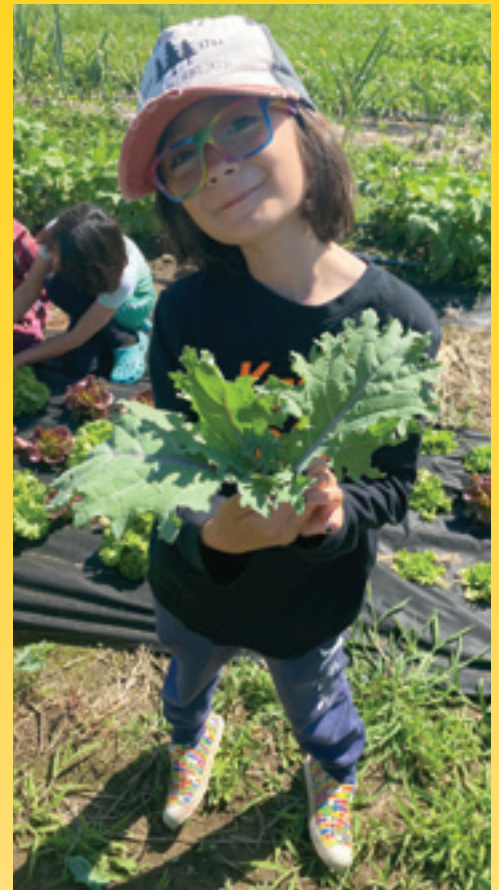
A participant in Field, Farm, and Forest's Farm Fridays' program gleaning kale with Salvation Farms at Wilder Farm in Lyndonville, Vermont.

We're optimistic and excited about what we can achieve. And we can't do it alone. We hope you continue on this journey with us.